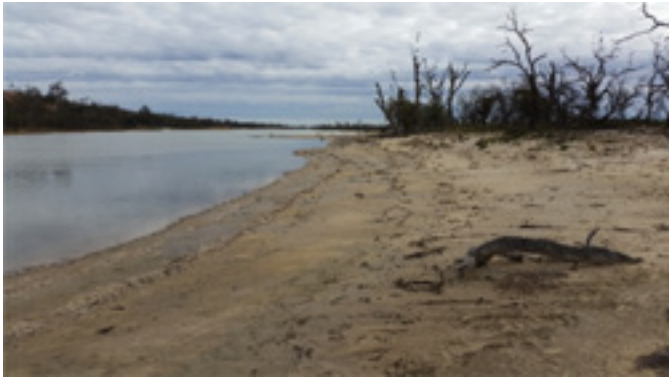
Vegetation die back due to salinity