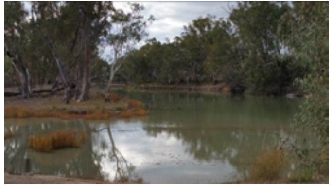
Managed salinity aids floodplain health