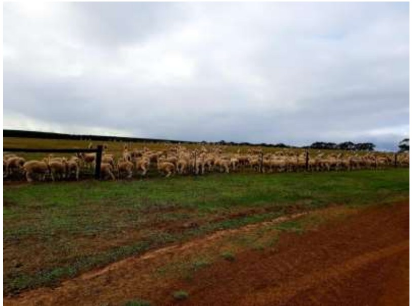
Proposed plantings on Stokes Bay property 2018