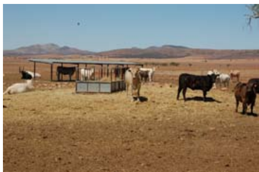
Figure 7: Drought lot with built shelter

This paddock should be well fenced and provide animals with adequate room, water, feed, and shelter from wind and sun (Figure 7). In addition, manure management will need to be considered in line with EPA (Environmental Protection Agency) requirements. The site chosen for a sacrificial paddock should have a low erosion risk (flat land), be at least 50 metres from any watercourse (wet or dry) and have a slope of no more than 8%. A sacrificial paddock should not be used for more than two years in five. Monitoring the condition of all stock is important when hand feeding. Feed ration tables are available for all classes of livestock to assist landholders maintain stock in appropriate condition.