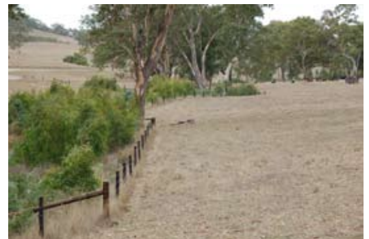
Figure 2: Exclusion of livestock is an important part of protecting watercourses