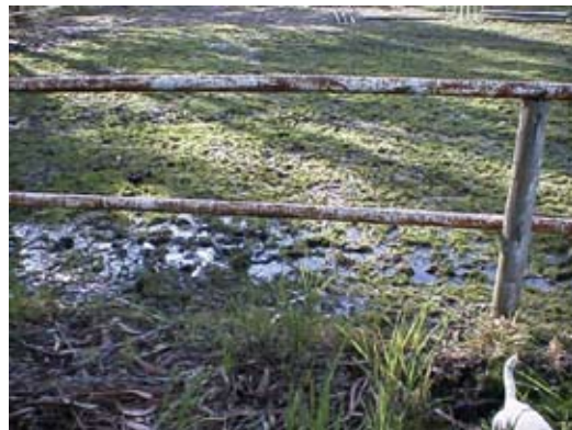
Figure 3: Avoid grazing waterlogged paddocks

For example, low lying waterlogged paddocks should be fenced as a separate paddock so that livestock can be excluded during the wetter months (ie winter) to avoid pugging of soil (Figure 3). As paddocks dry out, grazing can resume. For further information on property planning refer to fact sheet entitled "Property Management Planning".