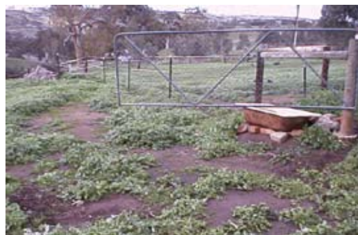
Figure 1: Overgrazing bares the ground which, in turn, encourages weeds