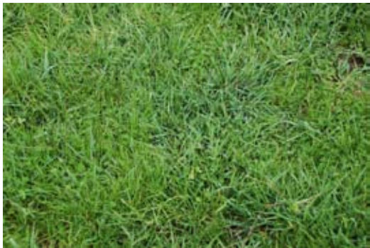
Figure 4: High quality pasture means more stock can be carried on a property