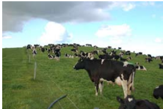
Figure 5: Dairy farms have high grazing pressures

intense grazing with large numbers of animals on a small area of land is the most beneficial way to utilise pasture (Figure 5). This is the key to better pasture management.