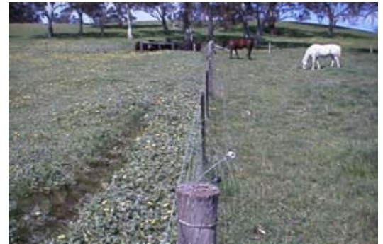
Figure 6: A poor grazing strategy has contributed to this capeweed infestation (left side of fence)

As well as adopting a good grazing management strategy it is important that soil fertility and weed control is tackled as part of a sustainable land management approach.