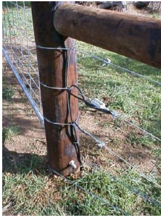
Figure 9: Electric fences are ideal for horses

Printed on Tudor RP 100% recycled Australian-made paper from ISO 14001-accredited sources