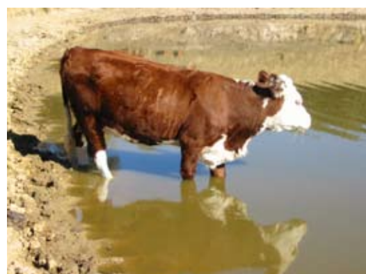
Figure 8: Exclude stock from dams to prevent water contamination

Ideally a reticulated watering system should be used. Water is pumped out of dams to a header tank and gravity fed to water troughs strategically placed in paddocks. This allows dams to be fenced off from livestock which contaminate water (Figure 8).