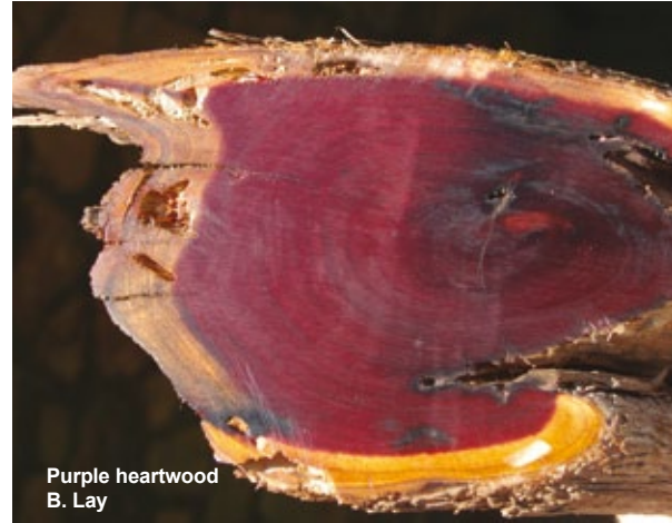
Purple heartwood B. Lay

Ongoing monitoring should enable a clearer definition of the main threatening processes and management needs of this unique species.