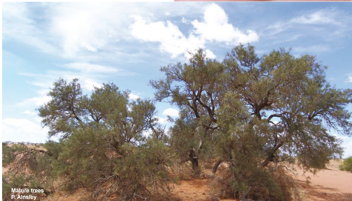
Mature trees