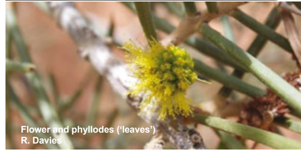
Flower and phyllodes ('leaves')