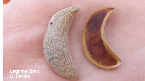
Legume (pod)