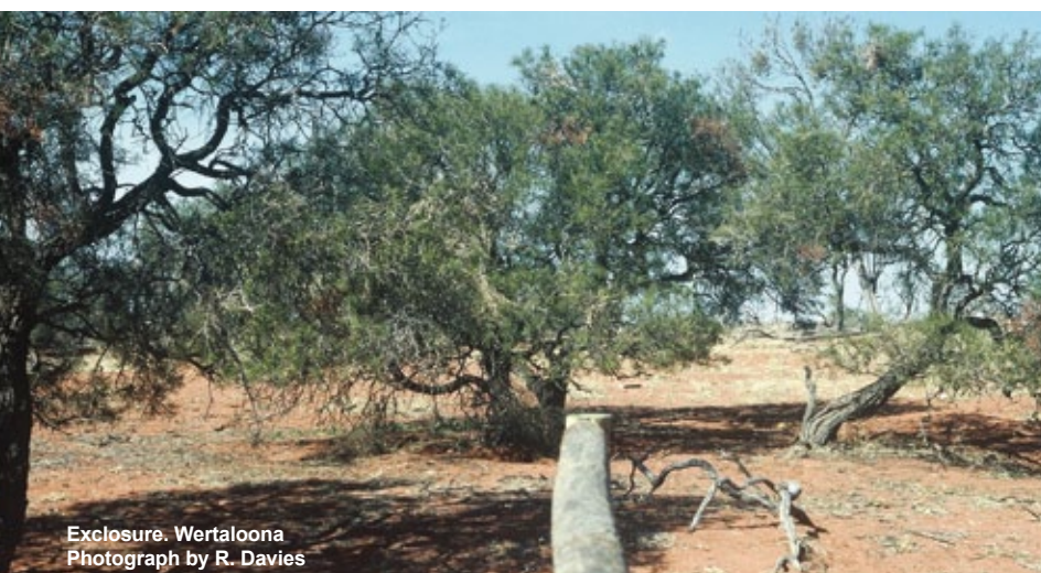
Exclosure, Wertaloona

Purplewood Wattle is restricted to the northeast pastoral district east of the Flinders Ranges towards Broken Hill. The species is not common but is reasonably abundant in the deeper sandy soils characteristic of the outwash areas adjacent to outcrops of schist or granite rock types. Such areas are particularly plentiful on Plumbago Station and the Bimbowrie Conservation Reserve. Annual rainfall is within the range of 175-200mm with no pattern of seasonality.