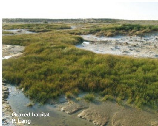
Crazed habitat P. Lang

The main significance of Salt Pipewort is its uniqueness and rarity. In South Australia it is the only member of the Eriocaulon genus – a group of plants consisting of more than 400 species primarily of tropical or subtropical origin – and it is rated as threatened or vulnerable on both State and Australian Government registers.