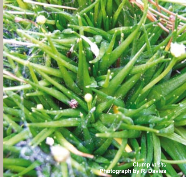
Clump in situ

Selectively burning this vegetation can improve the survival outlook for Salt Pipewort which appears tolerant of moderate burns.