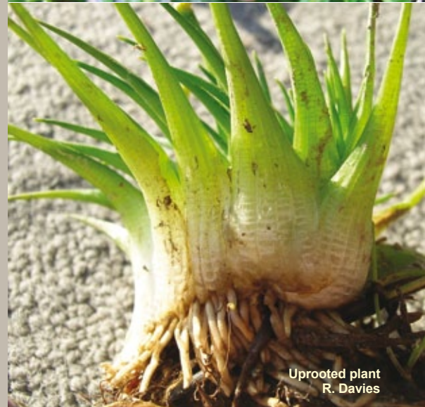
Uprooted plant